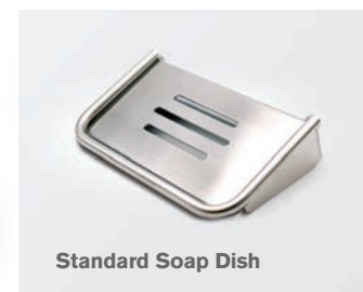
Standard Soap Dish