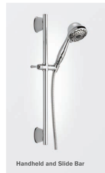
Handheld and Slide Bar