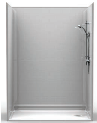
Barrier Free Shower